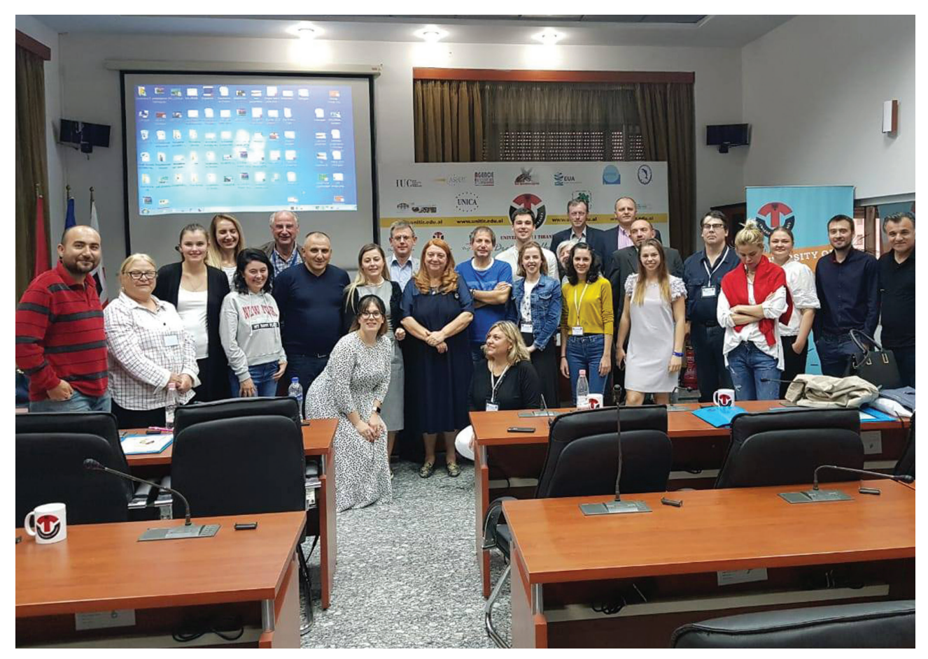
INFO DAY @ UNIVERSITY OF TIRANA