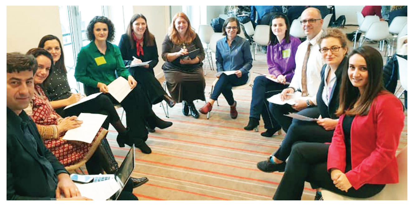
CBHE GRANT HOLDER MEETING 2020