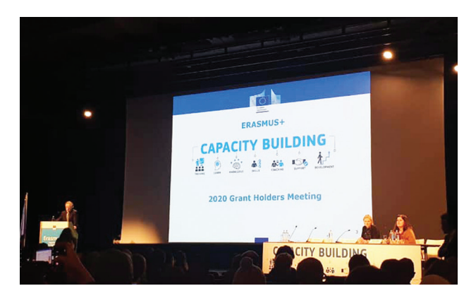
CBHE GRANT HOLDER MEETING 2020

The Kickoff Meeting of INTERBA project was held on March 9, 2020, with the participation of all project partners – a few of them participated online because of the COVID-19 pandemic. This meeting marked the start of the implementation of the project. Each Work Package as well as the Work Plan were presented in details during this meeting.